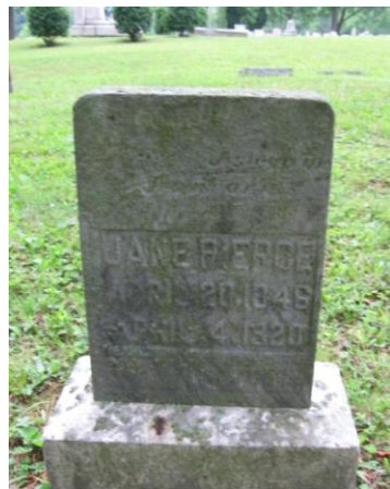
Grave of Jane (Platt) Pierce