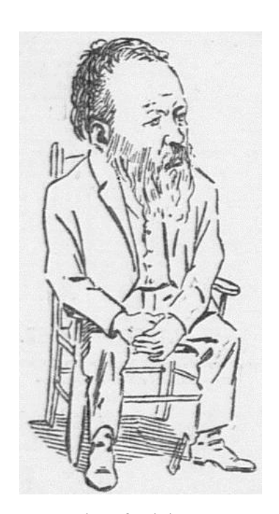
Drawing of William Platt